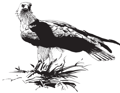
White-bellied Sea-eagle Haliaeetus leucogaster