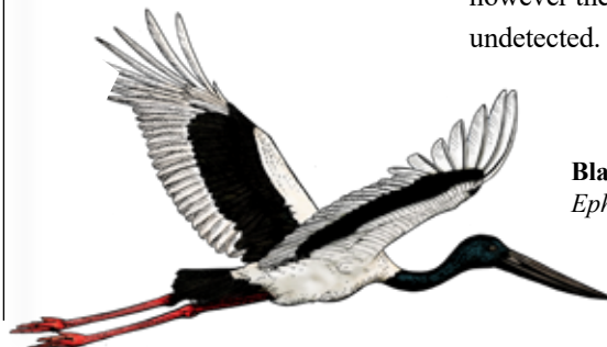
Black-necked Stork Ephippiorhynchus asiaticus

Saltwater Crocodiles - are periodically removed from Shoal Bay through an ongoing crocodile management program, however they may enter the area undetected.