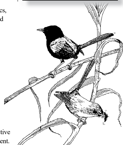
Red-backed Fairy-wren Malurus melanocephalus