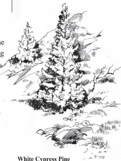
White Cypress Pine Callitris glaucophylla

Parks & Wildlife Commission of the Northern Territory