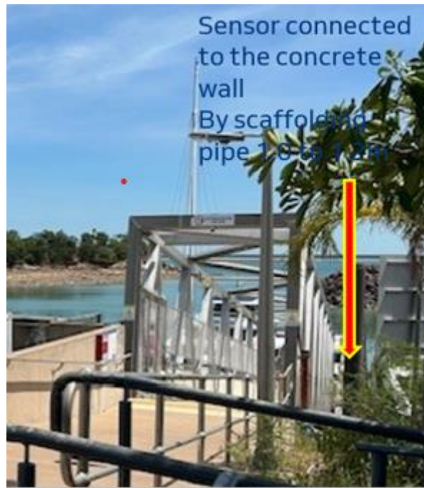
Figure 1 Location of the Radar