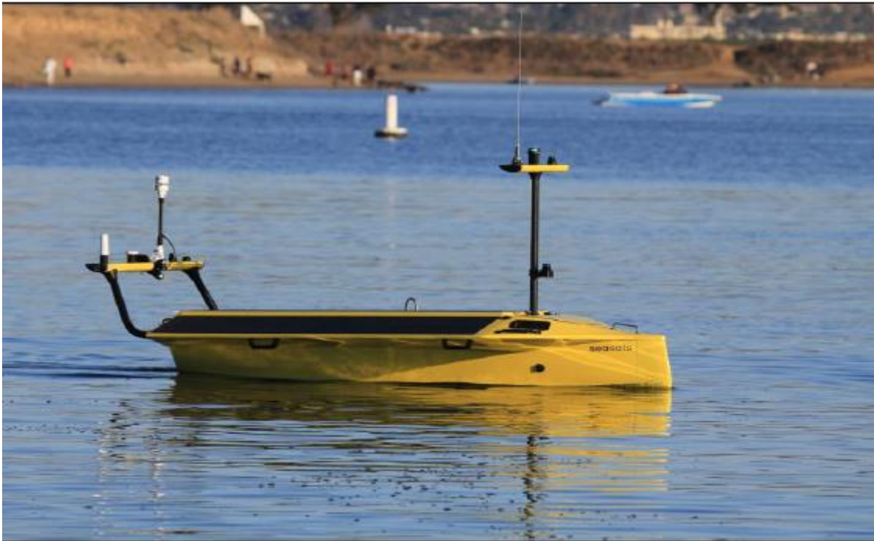
Small Craft Mooring Area, Frances Bay