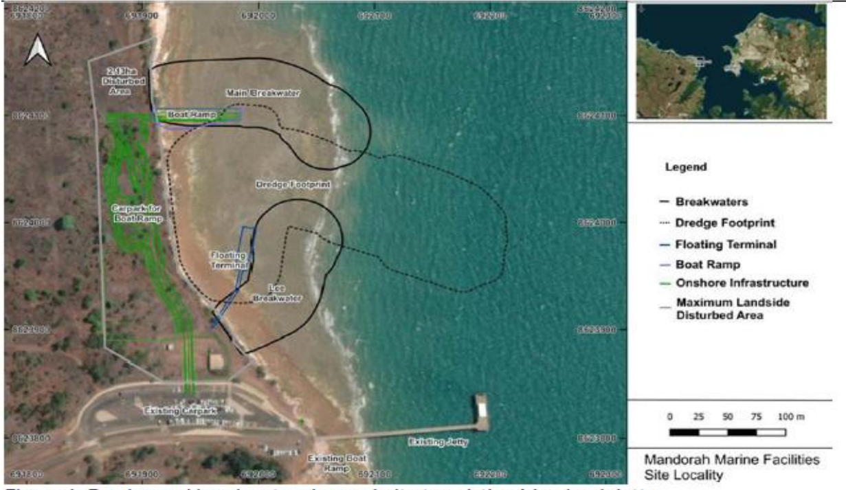
Figure 1: Dredge and breakwaters in proximity to existing Mandorah jetty.