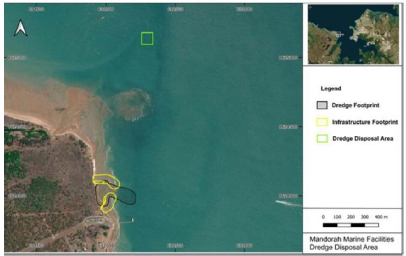
Figure 3: Dredge disposal area in proximity to dredge excavation works / existing Mandorah jetty