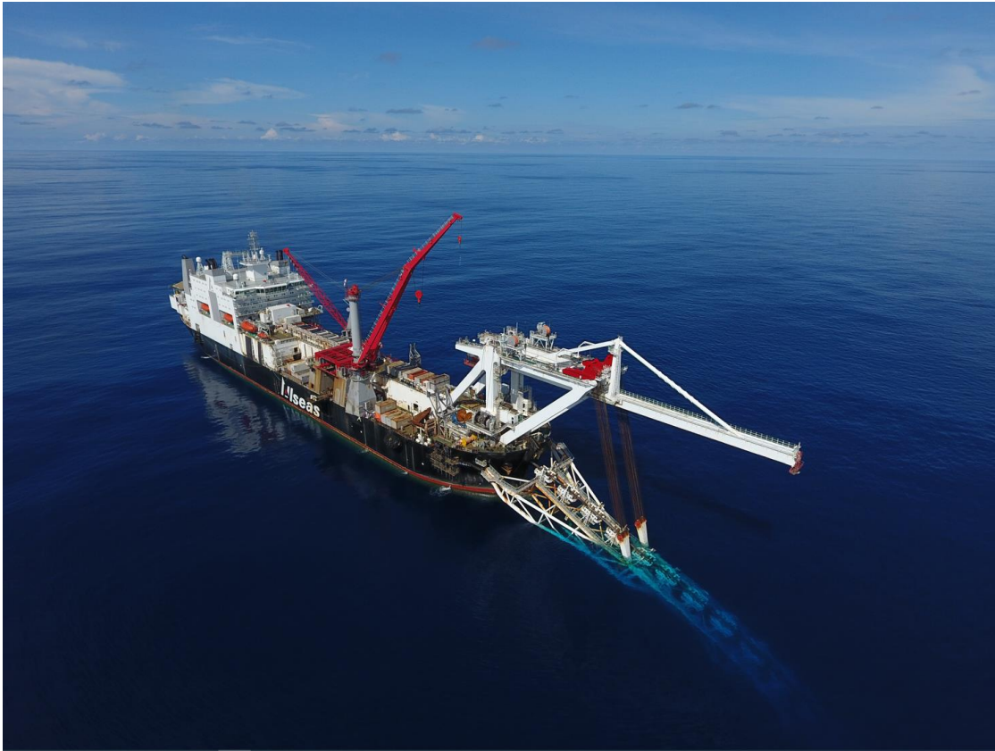
The ' Fortitude ' a subsea construction vessel that will be conducting Survey activities for the 'Audacia'