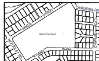
LOCATION DIAGRAM Not to Scale

NOTE: Unless where identified within this setback plan, all setbacks are to be in accordance with Clause 5.4.3 or 5.4.3.3.