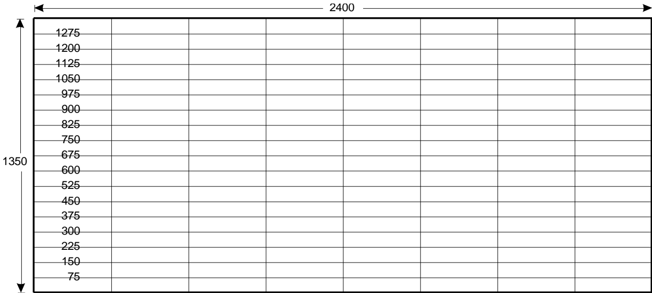
Front Elevation of Screen